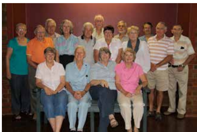
Happy gathering of past 1st Hillcrest adult leaders